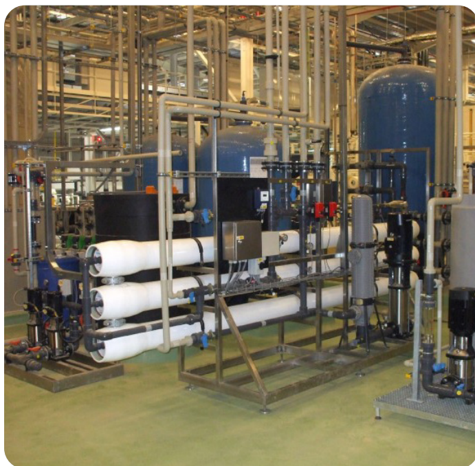
The installed Deioniser and Reverse Osmosis Plant as seen on site