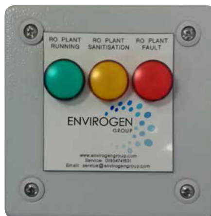
Remote wall-mounted alarm indicator