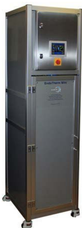
An EndoTherm Mini simplex RO System