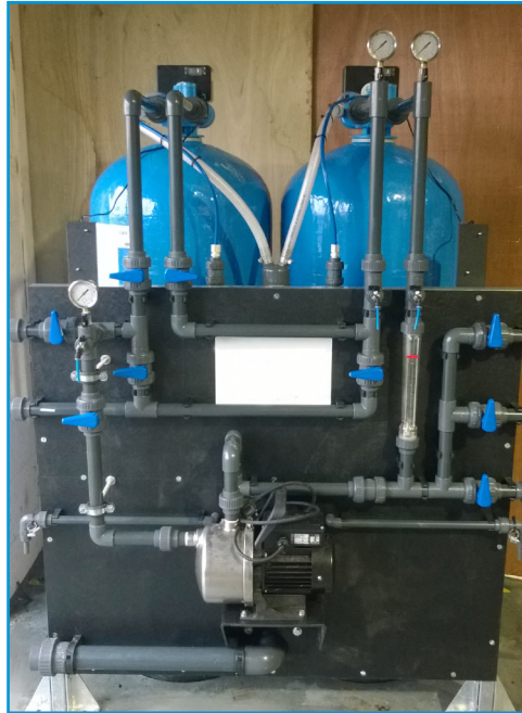
Trial plant on site in Europe

The brand had very clear reasons to use the Envirogen Group solution, which was first implemented in its European manufacturing centres and later into South East Asia. It was important that the solutions provider chosen for this work would have the capability to work across multiple territories. Not only did Envirogen have this capability, but it demonstrated the effectiveness of the solution in a very real way. Envirogen provided a fully functioning trial system at one of the client's central European plants, validating that the solution met the client's demanding requirements.