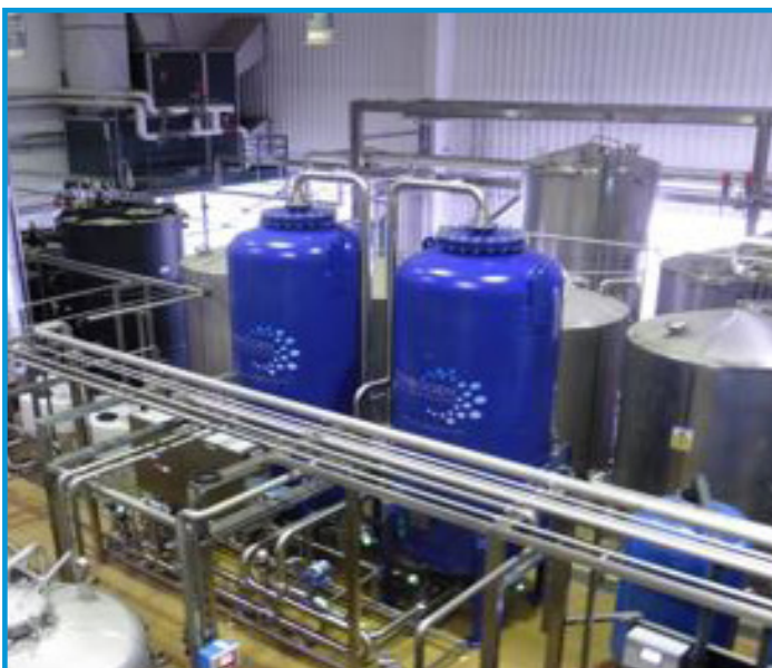
Final plant in situ

Bill Denyer, Director of Food & Beverage at Envirogen, explains: "To produce the consistent, pure and crisp taste we installed a two-stage skid-mounted ion exchange system contained within steel vessels, each with hygienic rubber lining to meet stringent food safety standards. The ion exchange system removes dissolved salts and reduces the conductivity of the solution. Carefully selected salts are then added, in a specific recipe, to create the exact flavour profile, providing the pure, consistent liquor that is required for the final product."