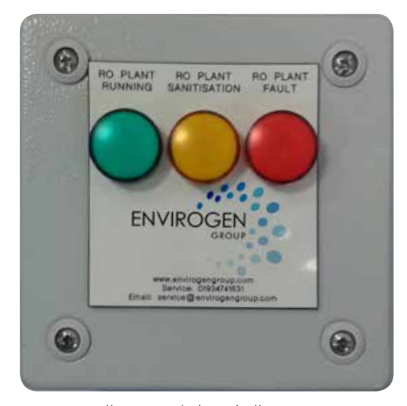
Remote wall-mounted alarm indicator

For automatic thermal sanitisation out of hours.