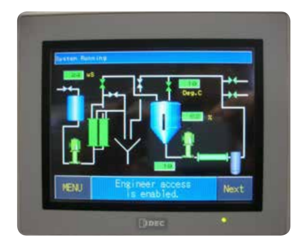
PLC controller with colour touch screen HMI for easy system programming